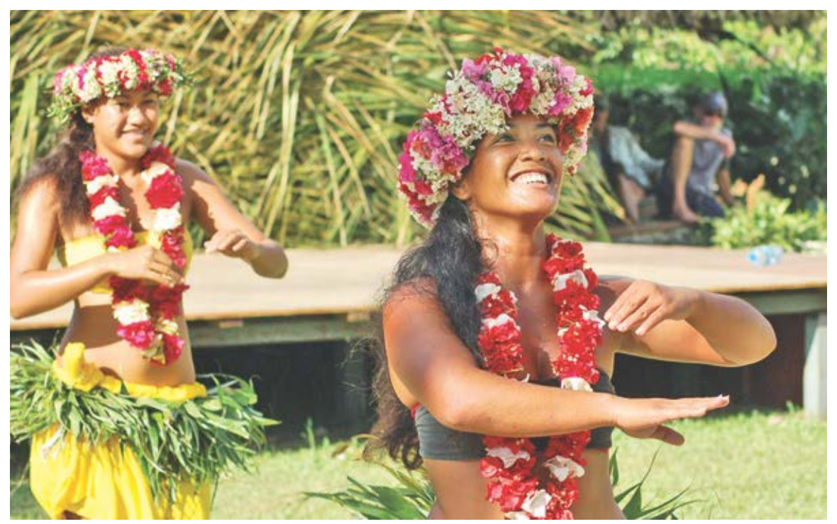
Still today, French Polynesians revere their centuries-old traditions.

This message confirms that you are officially registered with the 2023 Pacific Puddle Jump. So welcome to the fleet!