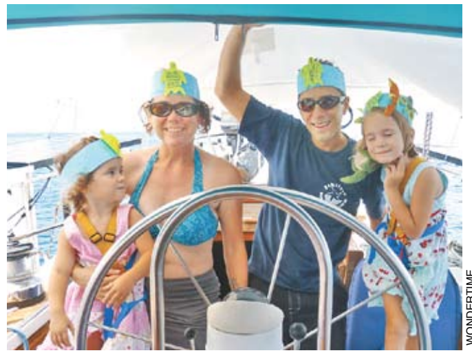
Equator-crossing party aboard 'Wondertime'. Not all parents would take kids so young across an ocean, but they all adapted well.

Evergreen—"I was very worried about how I would be able to handle the inactivity for all those days at sea since I'm a bit of an exercise nut. . . But in reality