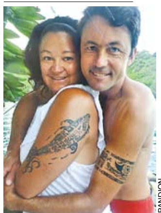
weather info Like many SoPac cruisers, (use Sailmail). the 'Pandion' crew couldn't

Stolen Kiss "Get access to better This is a must resist getting tattoos.