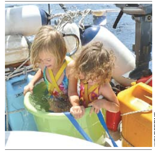
Who knew that a 26-day ocean crossing would be so much fun for a three- and six-year-old? The 'Wondertime' crew has happy memories.

Gato Go — "There is so much hype about the ITCZ. It is unavoidable, but the winds are seldom above 30 knots and only for a brief time. Don't head south too soon, follow the conventional wisdom of 125^{\circ} - 130^{\circ} W. Also, try to limit your expectations of what should