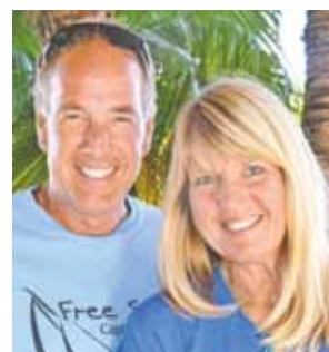
... of 'Free Spirit'