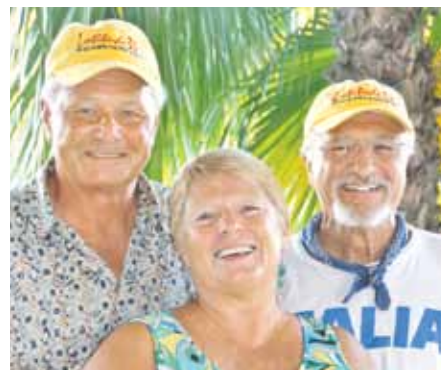
'Kookaburra' is heading Down Under.