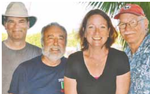
The happy crew of 'Time Warp'.

After a stint in Polynesia, Carla and Ed's plan is to sail north to Hawaii, then circle back to the Bay Area.