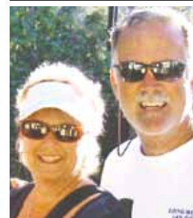
The 'Long Winded' crew.

Their plans are wide open, and may include a complete circumnavigation. "We want to inspire people not to wait