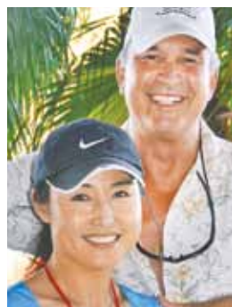
They sail 'Korbut Rose'.