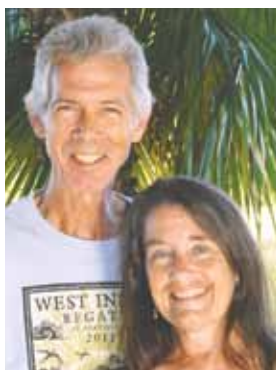
The 'Second Wind' crew.