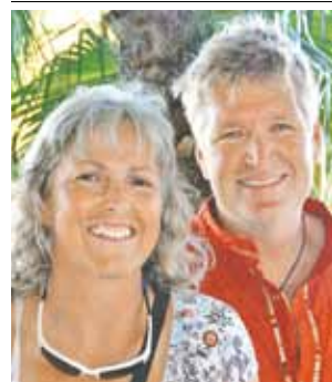
They say 'Aussie Rules'.

"We both love racing, sailing and just being on the water. So shortly after we got together we came up with the plan that A) we'd move to an island, and B) sail to Australia" — where Dave was raised. They're now on