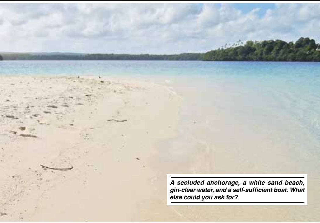
A secluded anchorage, a white sand beach, gin-clear water, and a self-sufficient boat. What else could you ask for?

to the top of his must-do list. He bought Gambol recently in Mazatlan, made some upgrades, and now she's ready to carry the couple over the horizon to French Polynesia and beyond — maybe even to Singapore. Their plans are wide open.