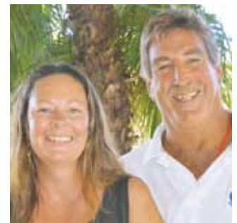
The Aussie crew of 'Pannikin'.

to see some of the West Coast before heading home to eastern Australia. So they harbor-hopped all the way up to Mexico — and loved it.