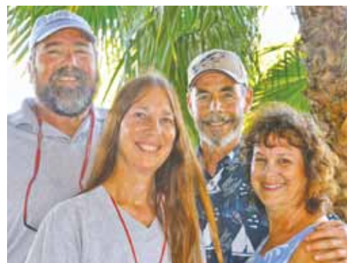
The jolly crew of 'Scintilla'.