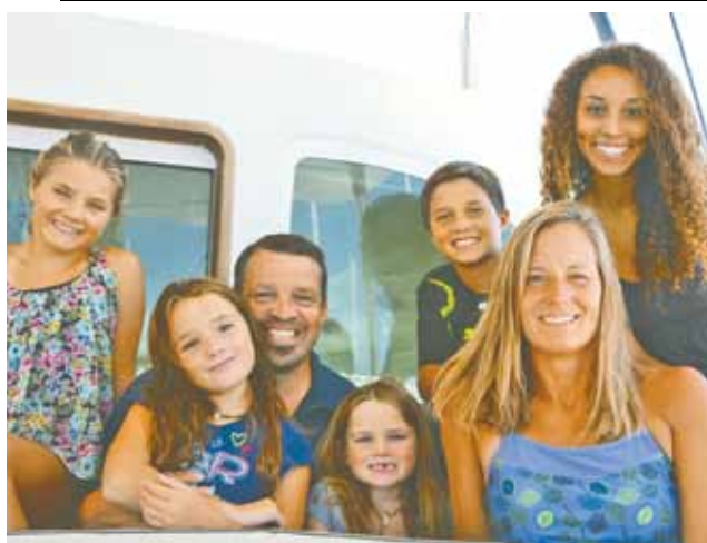
Members of this 'Circus' come in all sizes.