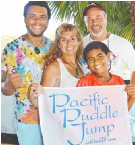
The 'Lorien' crew strikes a pose with their official Pacific Puddle Jump burgee. The timing couldn't be better for a their family cruise.

the dream of South Pacific voyaging to top-priority status in their lives, and have made whatever choices and sacrifices necessary to pursue that goal. Some have walked away from high-paying careers, some have sold their homes and liquidated virtually every other asset that didn't fit on their boats, and others tell us they'll simply cruise 'til they're broke and deal with 're-entry' when the time comes.