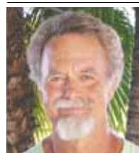
Mr. 'Four Choices'.