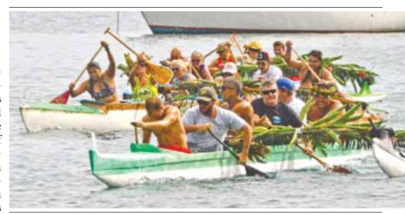
With extra muscle provided by Tahitian hosts, Kiwi and Fijian partners paddled to a hardearned victory in the final heat.

With less than five knots of breeze blowing at the appointed start time, we reluctantly instituted a 'rolling start',