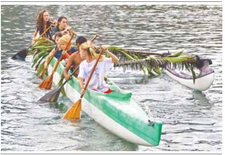
Probably no Rendez-vous'ers were more excited to try their hand at paddling than these cruiser kids.

The Rendez-vous ended with a short and simple awards ceremony during which the top three paddling teams received a hand-carved hardwood plaque