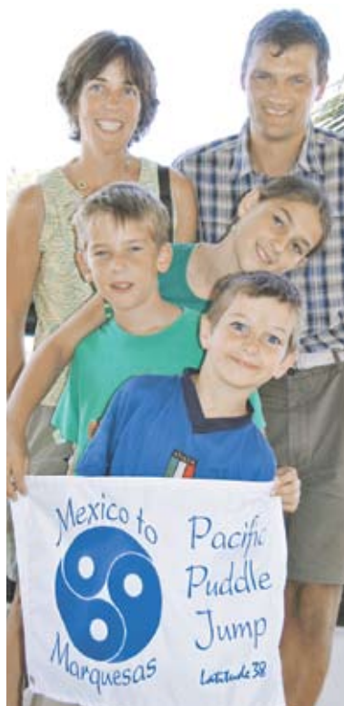
Aboard 'Bravado', crewmembers come in all sizes.