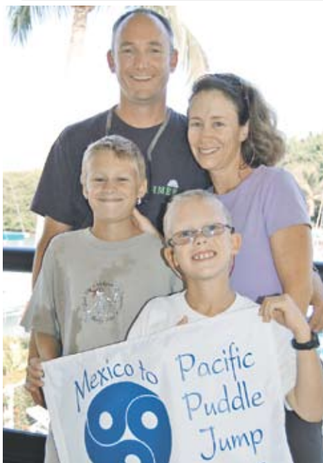
South Pacific voyaging is a family tradition for the 'Whisper' crew.

travels, pay off college and buy a smaller home in the Sierra foothills. Nice work!