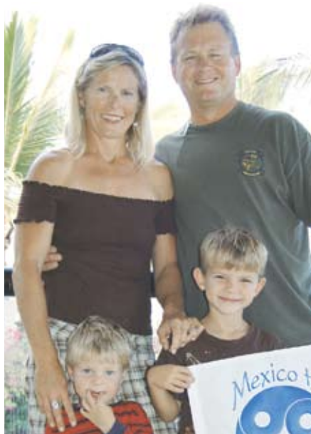
Mexico has been wonderful, but now the 'Love Song' is heading to new horizons.